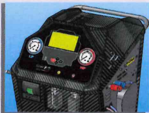
OKTA TOP/ SUPRA

This solution makes the ISC-branded machine unique in its kind. Fully automatic in the TOP and SUPRA versions, it is also offered in the LIGHT configuration where, while maintaining its innovative nature, it boasts an absolutely competitive market positioning. Even if equipped with the FULL OPTIONAL set-up, it is compact and extremely easy to handle.